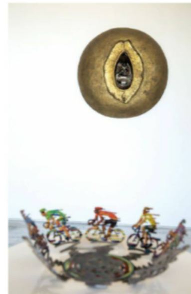
A WATER LOVER’S HAVEN (From top) The living area looks out onto the sea; Works by an Israeli artist

view of the open sea, which is surprising because you wouldn’t expect to see that from the outside.” The open-plan ground floor, designed with high ceilings to allow for natural ventilation (a massive ceiling fan assists in circulating air and exit ducts allow hot air to escape), houses the living, dining, and kitchen areas. The interiors are done using concrete, glass, and Calcutta marble from Italy, complemented with sleek, modern furniture from the brand Flexform. The stone kitchen is a custom fit, with the couple even flying in an Italian installer to get the job done. The dining table, designed to sit a good number of guests, is made of a massive slab of natural wood. Kinetic art pieces by Gabby Barredo, a favourite of the gentleman of the house, are placed in various areas, adding a touch of fluidity to the otherwise static skeleton. One of the house’s most outstanding features is the spacious deck—again, perfectly framed from the living room access point—overlooking the water. This communal space, perfect for hosting barbecues and simply lounging about, is where the owners elect to entertain friends.