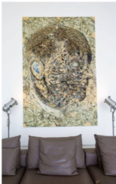
MODERN LIVING (From top) Wide windows and high ceilings allow for natural ventilation; A piece by Gabby Barredo on display in the living area

of the design, the end result ended up being a perfect fit for this unconventional terrain.” Given the location of the lot, it was an utmost necessity to build using materials that could withstand both harsh weather and salt water. Concrete, due to its durability, was chosen as the main material. Calma also thought to use the existing flora as well as the rocks collected from the digging to supplement the landscape (“It’s a house that cooperates with nature.”). To pay homage to the picture-perfect vistas that surround the lot, the priority was to construct the house in such a way that each area—by way of open spaces and windows—would be orientated towards the best possible view. This framing is carefully executed, each one highly intentional. “For the exterior, the design seems static and closed-off—and it is, because the clients wished to have a sense of privacy,” Calma explains. “The first design element one sees upon entering is a concrete staircase structure, which was inspired by an uphill climb due to the shape of the lot. Once you enter the house, what greets you is a